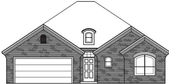
Austin - 1,485 total sq. ft.