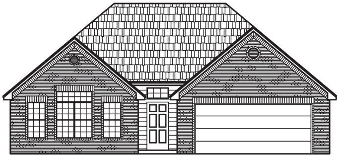
Wilcox - 1,581 total sq. ft.