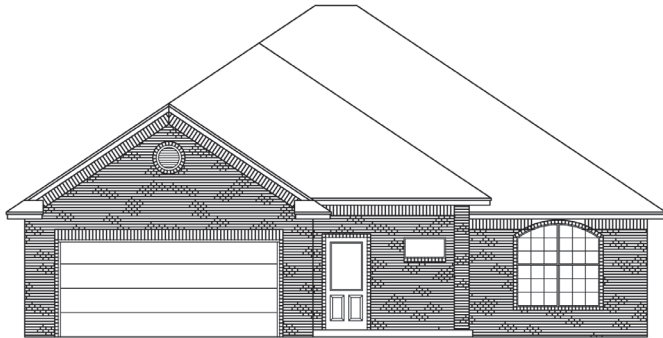
Seabrook - 1,724 total sq. ft.